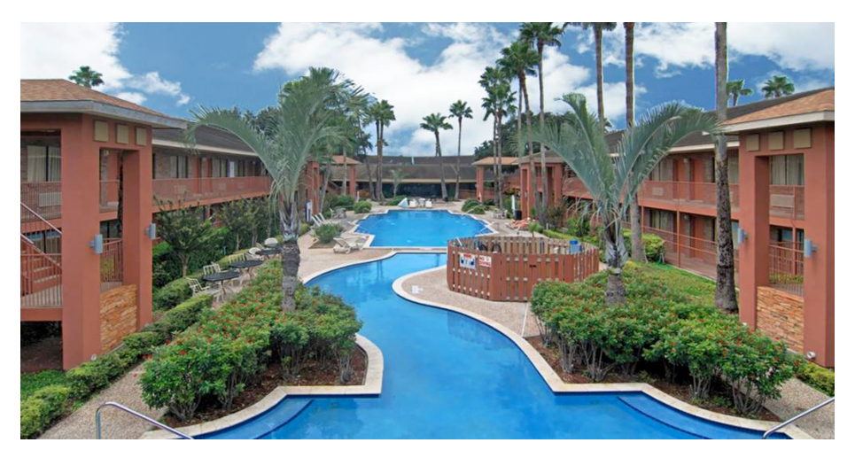
Palm Aire Resort Hotel

(www.bfcs.net) – BCFS is the granddaddy of resettlement for UACs. ORR 2014 grants totaled $280,156,954, strictly for "Residential Services for Unaccompanied Alien Children." One grant alone was over $190 million. BCFS does an astounding amount of work as a government contractor for HHS in many different areas, but this is obviously a growth industry for them. Last summer BCFS earned notoriety as the winner of a $50 million government contract to purchase Palm Aire Resort hotel in Texas and convert it to a 600 bed facility for illegals. The Resort featured indoor and outdoor pools, free Wi-Fi and cable. BCFS abandoned the contract following public outrage.